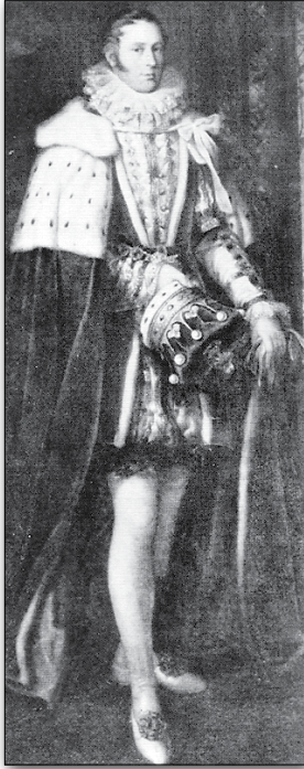
John Talbot, XVth Earl of Shrewsbury

EUROPE, and especially life in Rome, was a revelation to the American Connellys—ancient buildings, beautiful works of art, the society of so many cultured Catholics. As an intelligent and vivacious couple they were invited into the homes of many influential people, in particular that of the English Earl of Shrewsbury. Cornelia developed a close friendship with his lovely daughter, Gwendoline, who introduced her to work among the poor of Rome, and who was to die a few years later when she was still only twenty-two.