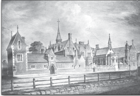
The Convent, Derby