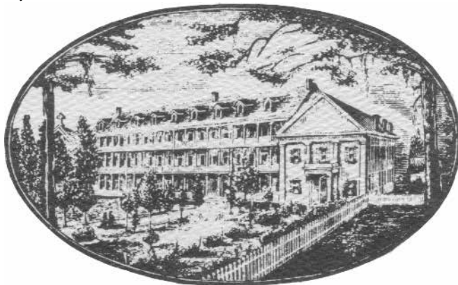
Academy of the Sacred Heart, Grand Coteau