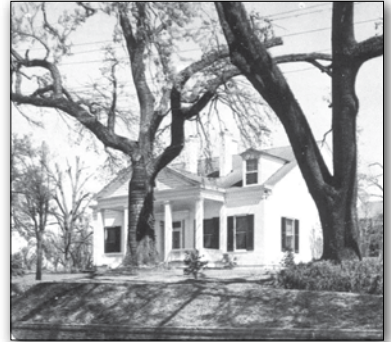
White Cottage, Natchez

IN THE EARLY YEARS of their marriage Cornelia and Pierce were blissfully happy “...they are and always have been about the happiest couple that ever breathed,” wrote Cornelia’s sister, Mary. Pierce had property in Natchez, hundreds of miles from Philadelphia, in the Mississippi valley, and he became the rector of Trinity Church there. Here their first two children, Mercer and Adeline, were born.