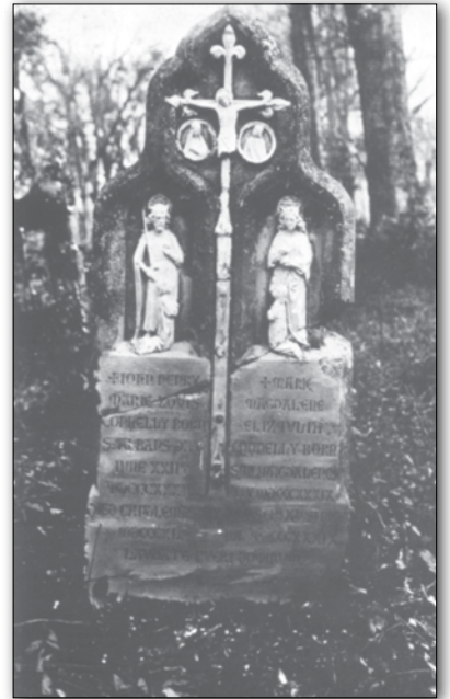
The children's original grave marker in St. Charles Cemetery, Grand Coteau

“Think of it twice and with deliberate attention, but if the good God asks the sacrifice, I am ready to make it to him and with all my heart.”