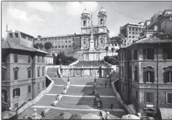
Trinitá dei Monti and Piazza España, Rome