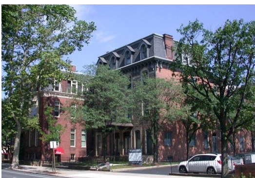
St. Leonard's Court, University of Pennsylvania

There, they flourished. The property, renamed Holy Child Academy but commonly called Sharon, became the Society's American base. In 1867, they opened a second boarding academy in two buildings in Philadelphia at Chestnut and 38th with a comparable program, named St. Leonard's Academy for their English home, now owned by the University of Pennsylvania.