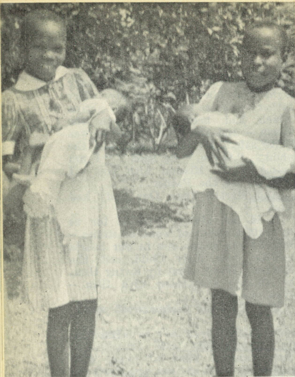
Big Twins enjoy taking care of Little Twins at Ifuho.